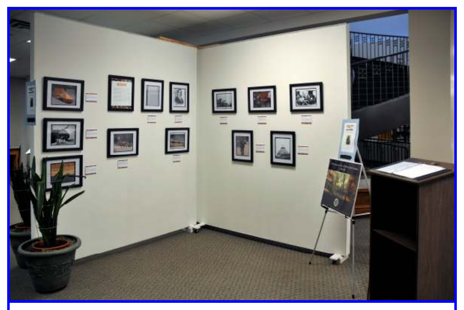
Part of the Civil War Photo Exhibit now on display.

In the very near future our new address <a href="http://www.wilsoncountypubliclibrary.org">http://www.wilsoncountypubliclibrary.org</a> will take you to the library's Enterprise website first and from there you will be able to navigate to the online catalog. We will be using the Enterprise homepage as our temporary website, but we felt that we needed to move to the new online catalog as soon as possible. We apologize for any confusion caused by these changes and hope that you agree the new online catalog is much more user-friendly than the previous online catalog! For more information, please contact Becky Callison at 252-237-5355 ext 5024.