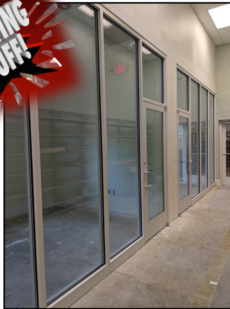
Current renovations of the main library's new Study Rooms.