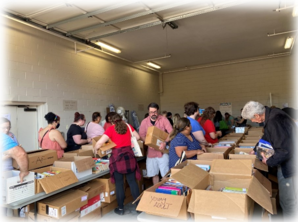
The Sale in Progress

But one sale leads to another, so the Friends are already hard at work on the one for 2023 and are now restocking the shelves in anticipation another outstanding year. A volunteer will be available on the 3 rd Wednesday of each month from 1 – 3 to accept your donations.