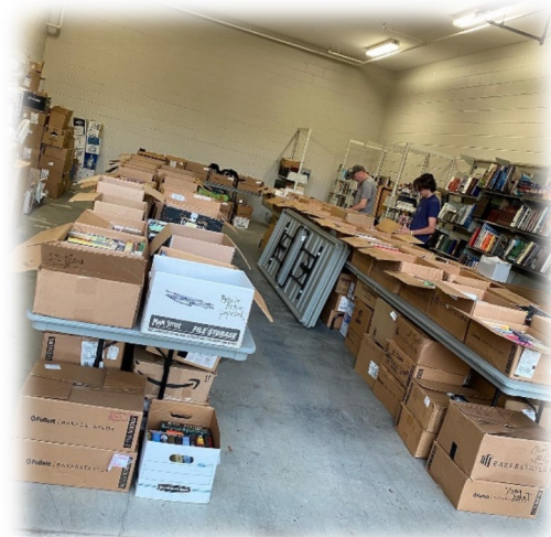
Volunteers spend days organizing the books for the sale

The Whirligig Book Sale for 2022 was a terrific success! The total amount made to help the library with projects and new title purchase was $2,081.25. Previously, the Friends have used the bookmobile, parked in the middle of the Whirligig action on Nash Street, to display the sales books. While the location was excellent, the logistics were daunting. The bookmobile didn't have a much floor space to accommodate our customers, and the bookshelves were limited. Resupply was a constant necessity. Like ants making a conga line back to their nest, volunteers went back and forth to the library storage, at times resorting to using a hand-cart. It was obvious that a change needed to be made.