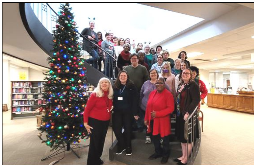
A staircase filled with the Library's smiling and helpful staff

The Friends of the Library underwrites the Staff Appreciation Luncheon for the yearly Staff Training Day. These people are always so helpful and keep the library running like a well-oiled machine. This is one way we can acknowledge their importance in making the library what it is.