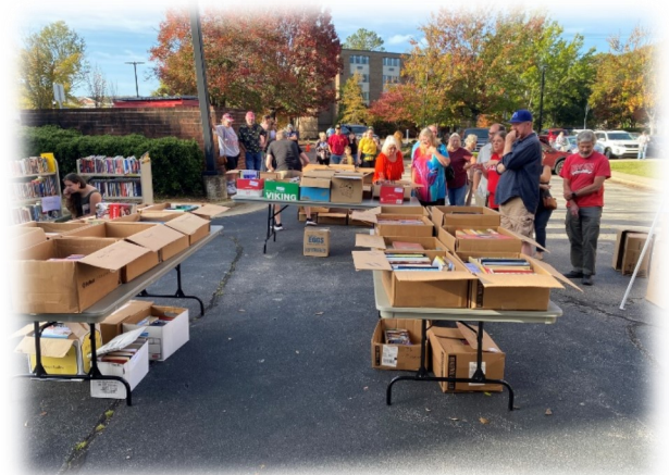
Customers wait for the sale to open

Using the donated books, we were able to keep the Little Libraries around town well-stocked, and we were able to fulfill the needs of organizations that requested help. The